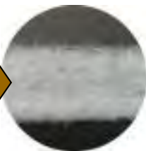
E. P. White Media Profile