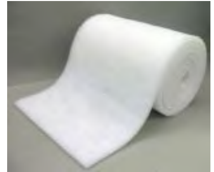
E. P. White Bulk Rolls