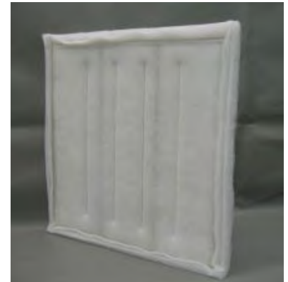
E. P. White Panel

E. P. White test data is available on the Fiber Bond finishing products catalog CD or by contacting the marketing department at (219) 879-4541.