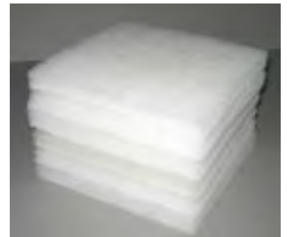
E. P. White Cut Pads